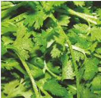
Cilantro / Coriander