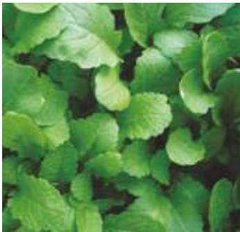
Mustard Greens (Sarso)