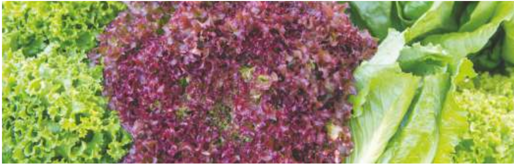
Leafy Varieties of Lettuce

Choose your pick from various leafy veggies and herbs which can be grown in VeggieStar